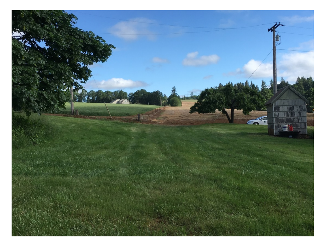
SOUTH END OF UN-NAMED PORTION OF C.R. 765 LOOKING NORTH