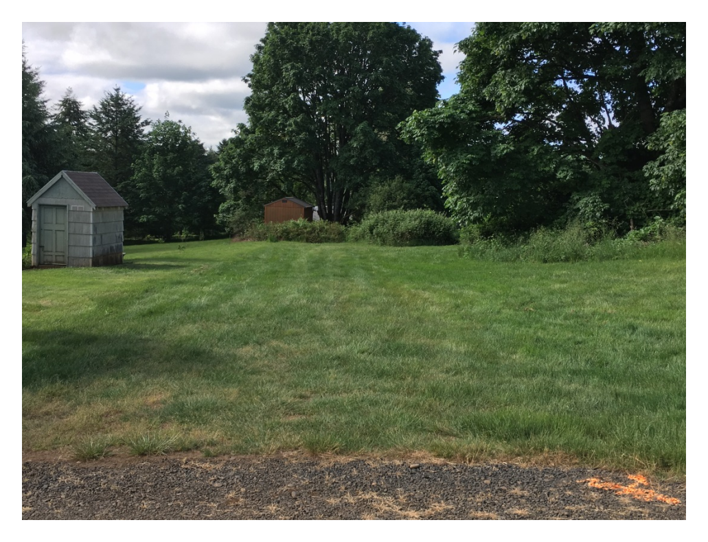
NORTH END OF UN-NAMED PORTION OF C.R. 765 LOOKING SOUTH