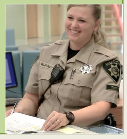
Tuesday, January 29, 2019 4:30 – 6:00 p.m. Refreshments will be served!