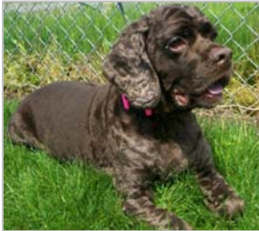
Molly at the shelter.