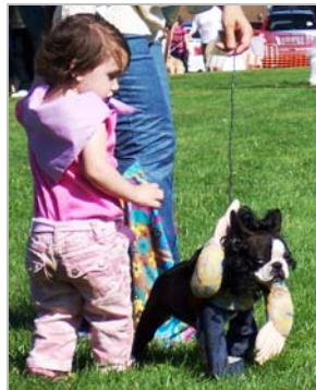
One of the shelter's littlest supporters with a dog just her size.

The 4 th Annual Marion County Dog Fest drew nearly 200 canines and 300 people to Chemeketa Community College on Saturday, September 12 for a day of fun, food, games, contests, and demonstrations. It was a beautiful sunny day. (A little hot for some, but the dog pools kept the dogs cool.)