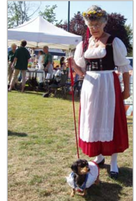
Winner of the Best Costume Contest.

New this year were contests, which proved very popular. We started the day with Best Costume, followed by Look-a-Like, Most Mixed-Up Mutt, Best Tail Wag, and Biggest & Littlest Dog. Everyone was a winner with first, second, and third place receiving gift certificates, and all other dogs receiving a doggie-toy. In between contests, there were great demonstrations by Oregon K-9 Search Teams, Marion County Sheriffs Office and Keizer Police Department K-9, and The Joys of Living Assistance Dogs.