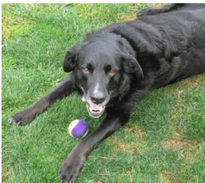
A slimmer & trimmer Buddy guards his favorite ball