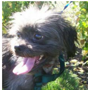
All fixed up & ready for adoption!

Did you know?... The Shelter gladly accepts donations for our Emergency Medical Fund , which supports special care for dogs like Oscar. Please ask our staff for more information, and your tax advisor can tell you if it's deductible.