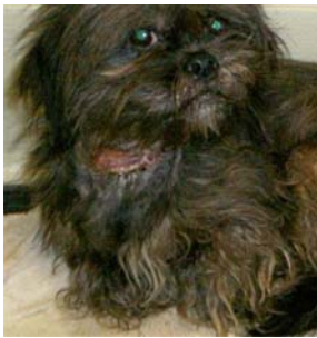
Oscar as he came to the Shelter