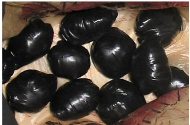
11+ ounces of Heroin