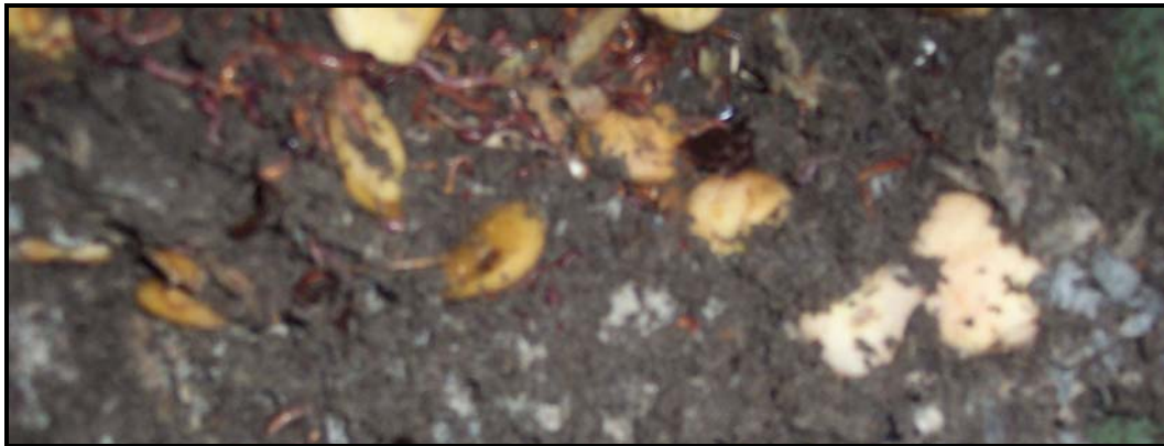
This picture shows a mass of red worms gathered to feast on pear scraps. The other parts of the bedding have very few worms.

If you want, you can use this method to conduct a “worm taste test”. Bury three or four different kinds of food in the different areas of the worm bin. Come back in two days, and see which food has the most worms gathered around it. The general rule is that worms love anything juicy and sweet. Try it and see for yourself.