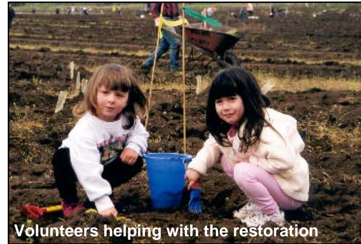
Volunteers helping with the restoration