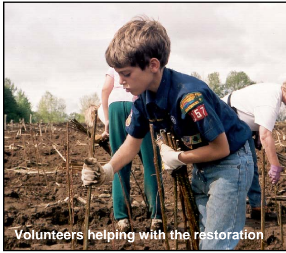
Volunteers helping with the restoration