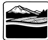
Marion County Health Department