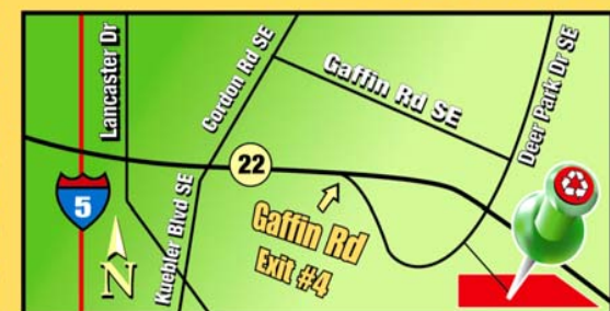
SALEM-KEIZER RECYCLING & TRANSFER STATION 3250 Deer Park Dr SE, Salem, OR 97317