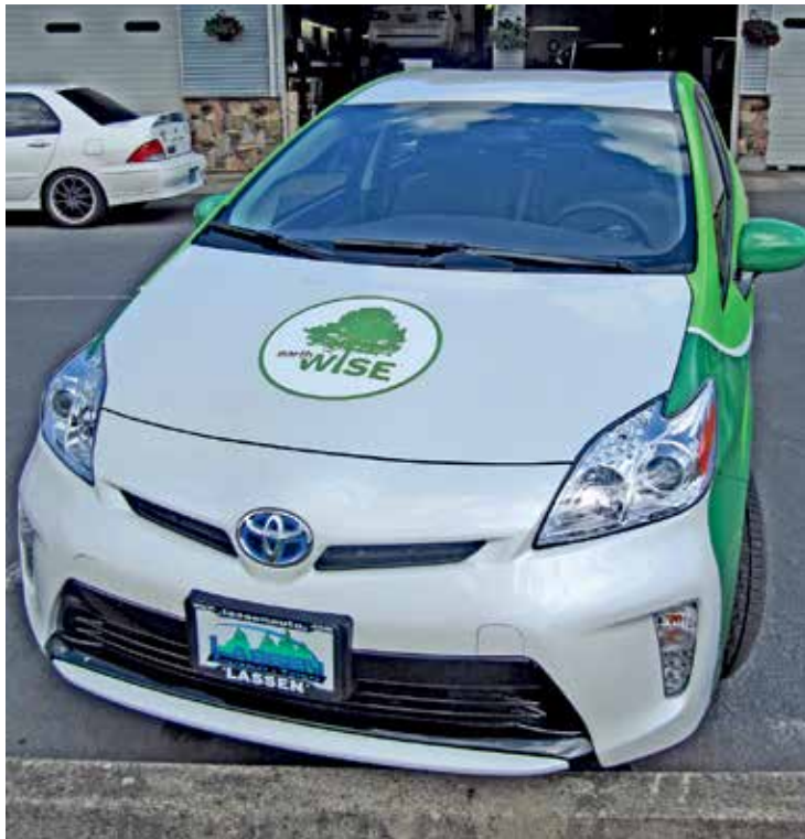
AJ's auto repair added the EarthWISE logo to their shuttle car to remind others to reduce, reuse, and recycle.

For more information about the EarthWISE program, go to www.mcEarthWISE.net or call 503-365-3188.