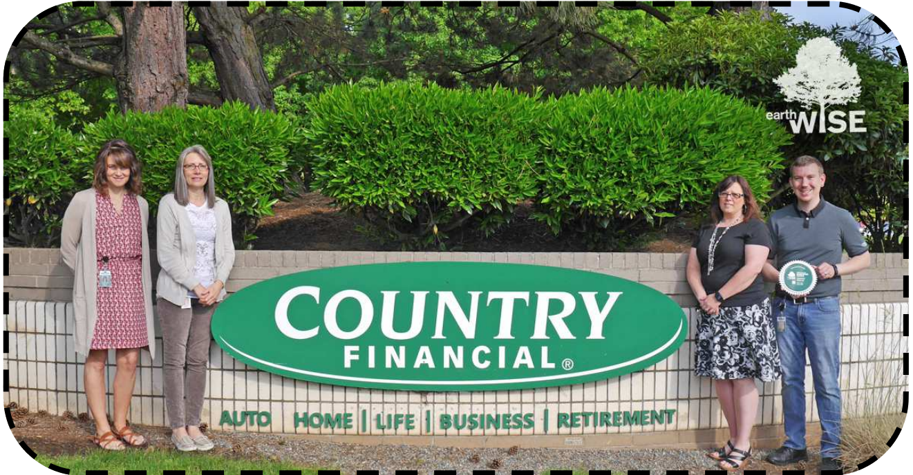
Country Financial 2015 - 2018