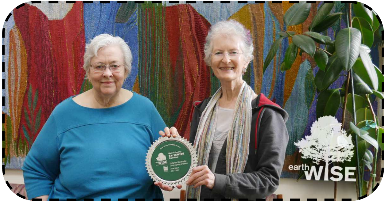
Unitarian Universalist Congregation of Salem 2014 - 2018