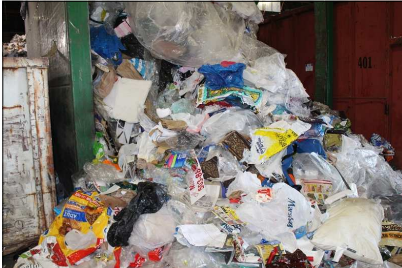
13% of mixed recycling material Garten receives is garbage.

Because Garten Services has such an extensive machine and hand sorting system, it didn't have a problem meeting that standard.