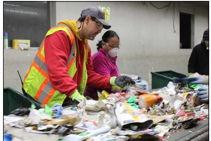
Garten employees recycle one million pounds a week.

The nonprofit sees its mission to create opportunities for people with disabilities as an essential part of the three prongs of sustainability: economic, environmental and social equity.