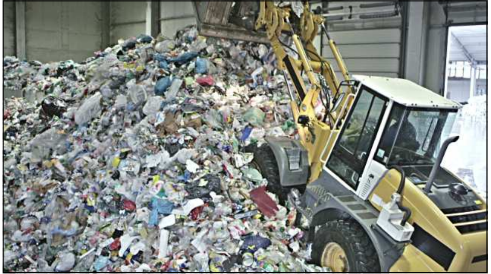
Mountains of material come into the Garten Services recycling warehouse.

Every week, Garten employees recycle one million pounds of cardboard, paper and plastic (items found in residential blue bins.) About 320,000 pounds of shredded paper gets recycled each month through the nonprofit's secure document destruction program. And 400,012 pounds of electronics—everything from computer monitors to cassette recorders—are recycled each month. And each year, Garten's electronics recycling keeps more than 5.4 million pounds of electronics out of the landfill, where they can leach heavy metals into the ground.