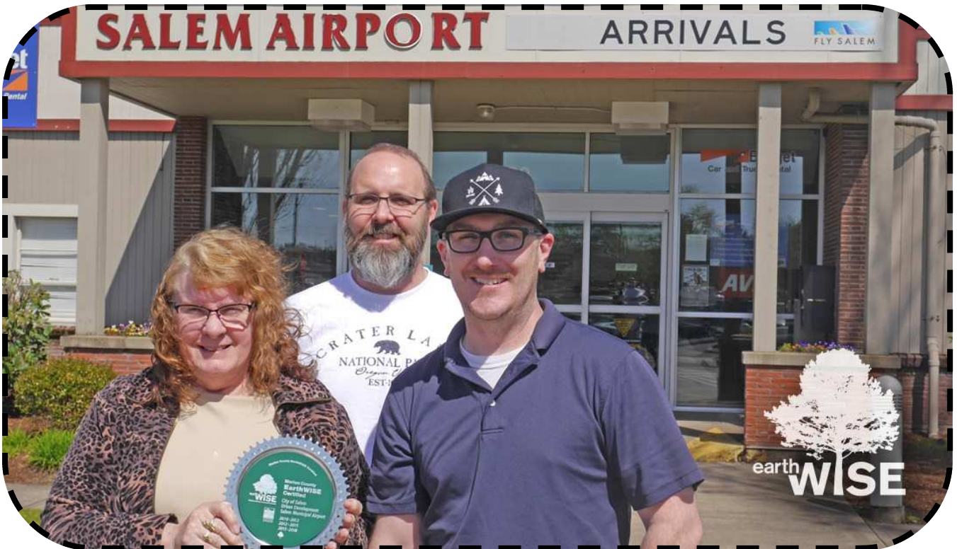
City of Salem Urban Development Airport Division 2010 - 2018