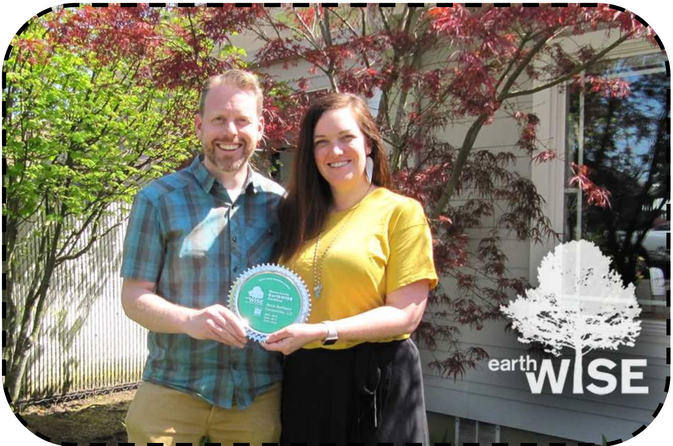
Pence NW Construction, LLC 2012 - 2018