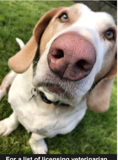
For a list of licensing veterinarian partners, visit: www.mcdogs.net