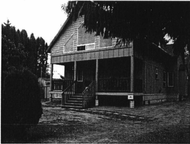
NORTH SIDE OF HOUSE

If using the Elevation Certificate to obtain NFIP flood insurance, affix at least 2 building photographs below according to the instructions for Item A6. Identify all photographs with date taken; "Front View" and "Rear View"; and, if required, "Right Side View" and "Left Side View." When applicable, photographs must show the foundation with representative examples of the flood openings or vents, as indicated in Section A8. If submitting more photographs than will fit on this page, use the Continuation Page.