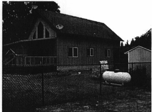
EAST SIDE OF HOUSE