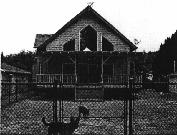
SOUTH SIDE OF HOUSE