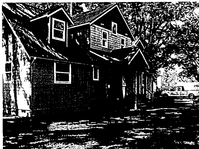
NORTH SIDE OF HOUSE