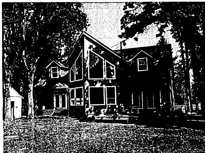
SOUTH SIDE OF HOUSE