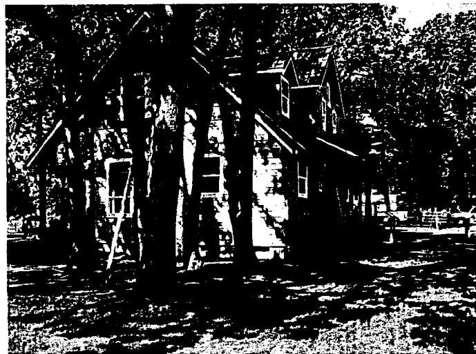
EAST SIDE OF HOUSE