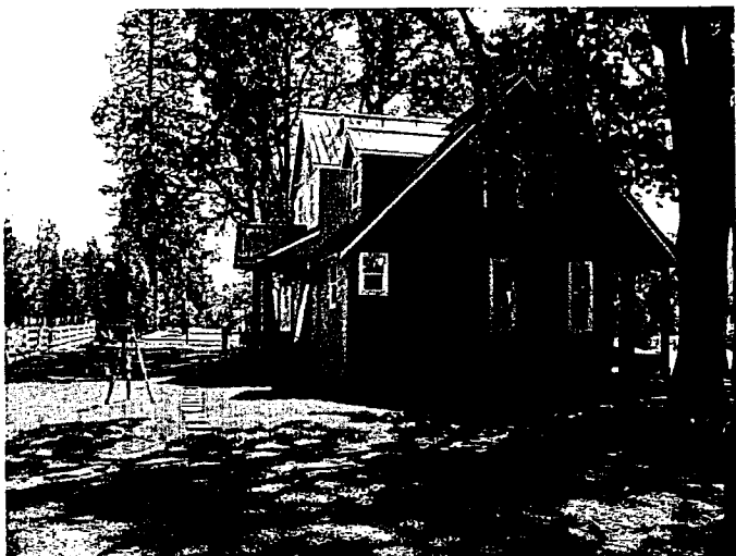
WEST SIDE OF HOUSE

If using the Elevation Certificate to obtain NFIP flood insurance, affix at least two building photographs below according to the instructions for Item A6. Identify all photographs with: date taken; "Front View" and "Rear View"; and, if required, "Right Side View" and "Left Side View." If submitting more photographs than will fit on this page, use the Continuation Page, following.