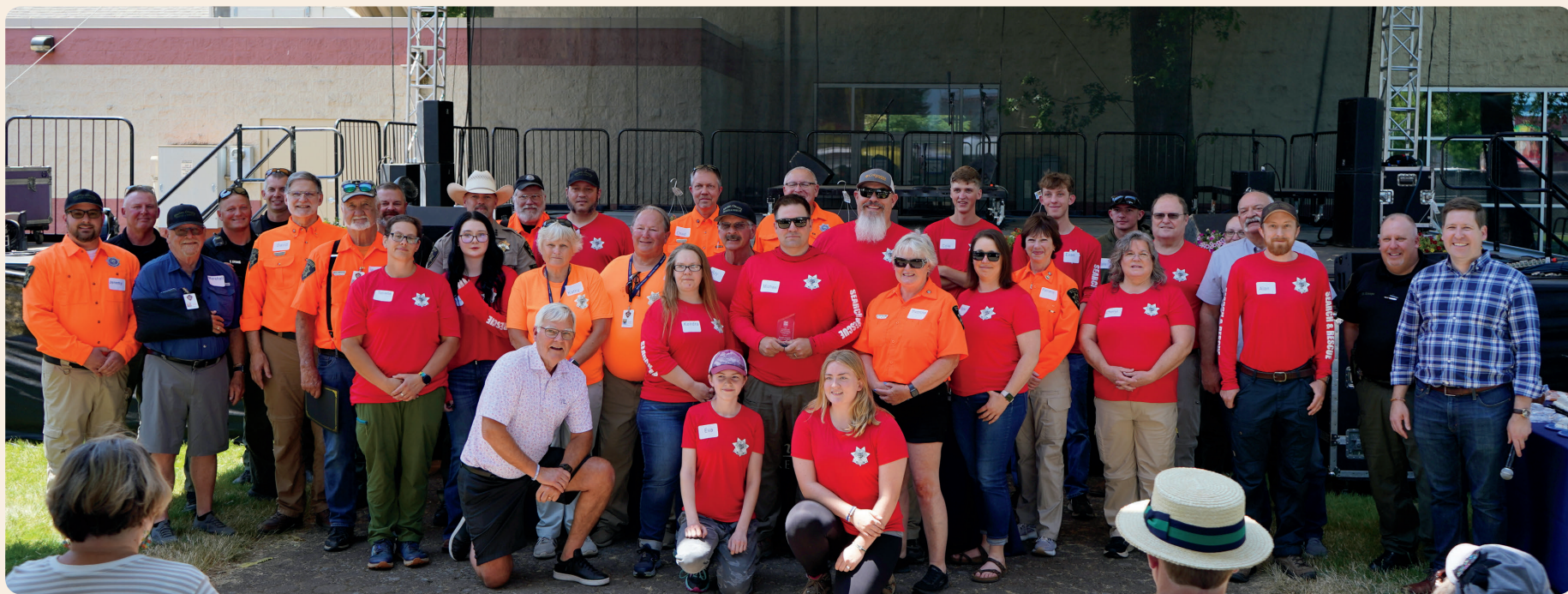
Search & Rescue Team, Sheriff's Office