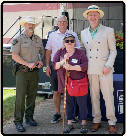
Meda Duggan Justice Court