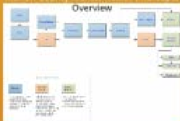
Marion County Mental Health Intercepts