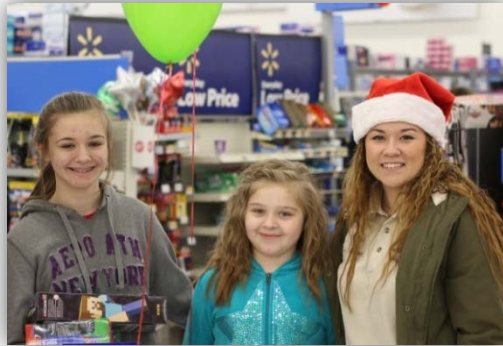
Shop with a Cop, 2017

During 2017, volunteers recorded a total of 302 hours, assisting with administrative duties at the Jail Administration, Enforcement, Operations, Civil Unit and CHL.