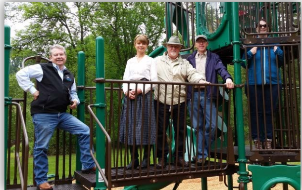
Field trips required: Parks Commission members get hands-on for the love of parks.

The Parks Commission continues to provide guidance on many parks activities and projects. This past year the Commissioners participated in several park tours. They are currently working together and with park staff on what changes they envision for the parks in the future.