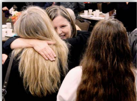
Attendees at the 9 th annual "Giving People a Second Chance" community breakfast, October 27 th , 2017.

A major focus and purpose of Marion County's Reentry Initiative is to assist individuals who are reentering our community after incarceration. The Inspire Program was launched in 2016 specifically for this purpose, weaving together local talent, providing a safe and supportive learning environment, and encouraging clients to learn about new skills and interests that will assist them in their successful reentry into the community. Volunteers led workshops on a variety of topics this year, from cooking to dressing for success!