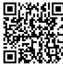
Apple - App