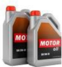
Motor oil (free of water and debris)