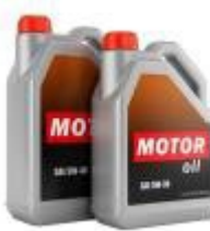
Motor oil (free of water and debris)

In addition to paper, plastic, and metal from curbside/on-route list above