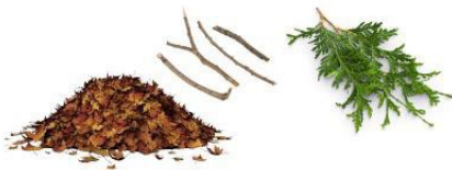
Yard debris: Leaves, branches, sticks, grass clippings On-route from residential and non-residential customers