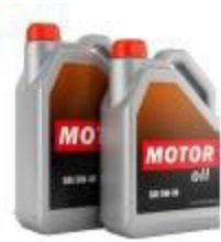
Motor oil (free of water and debris)

In addition to paper, plastic, and metal from curbside/on-route list above: