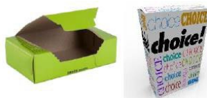
Paperboard packaging, e.g., cereal and cracker boxes (No packaging meant for refrigeration or freezer)