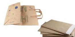
All kraft paper, brown paper bags, mailers (Not plastic lined)