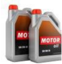
Motor oil (free of water and debris)

In addition to paper, plastic, and metal from curbside/on-route list above: