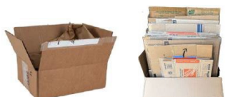
Corrugated cardboard, clean pizza boxes (No wax coating)

Material preparation: Empty and dry materials, flatten boxes, place loose in curbside cart