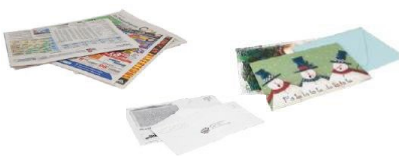
Office paper, newspaper, newsprint, other printing and writing paper, e.g., junk mail, envelopes, greeting cards