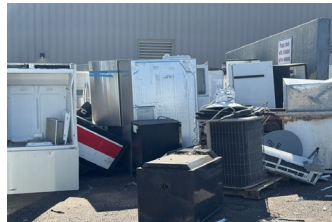
All scrap metal, made of ferrous and non-ferrous metal, including appliances