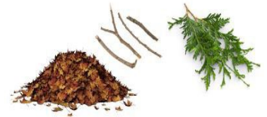
Yard debris: Leaves, branches, sticks, grass clippings