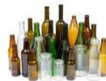
Glass bottles and jars On-route from non-residential customers

DEQ does not discriminate on the basis of race, color, national origin, disability, age, sex, religion, sexual orientation, gender identity, or marital status in the administration of its programs and activities. Visit DEQ's Civil Rights and Environmental Justice page .