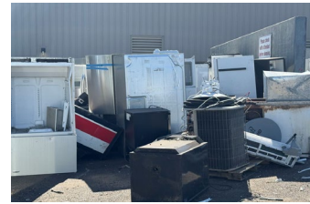
All scrap metal, made of ferrous and non-ferrous metal, including appliances