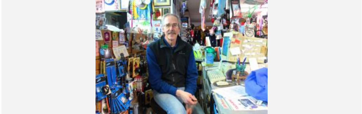
Wolf in South Salem Cycleworks