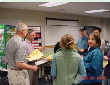
Marion County Master Recyclers network during a class break.

In 2008, Marion County will be offering two Master Recycler classes. The first begins January 10, 2008 and runs until February 28, 2008. The second begins March 6, 2008 and runs until May 1, 2008. For more information, or for an application, visit our website at: www.co.marion.or.us/pw/es/master or contact Kim at 503-588-5169 ext. 5920 - or- kdinan@co.marion.or.us