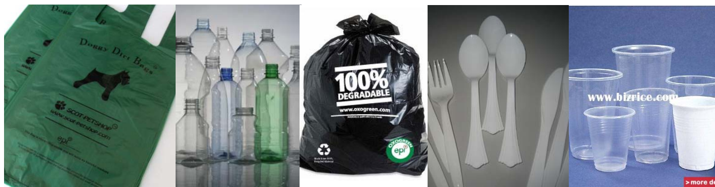
Products made with oxo-degradable plastic are virtually indistinguishable from their traditionally made counterparts