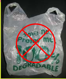
Just Say "No" to OXO! p. 4

MARION COUNTY PUBLIC WORKS - ENVIRONMENTAL SERVICES