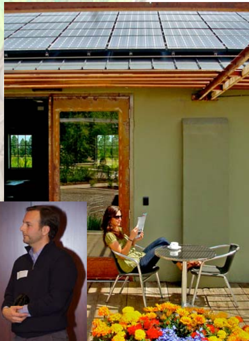
Green Building of the Year— Retrofit Painter's Hall at Pringle Creek Community