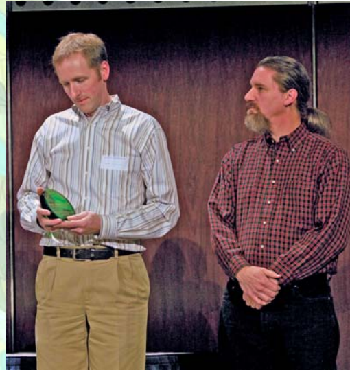
Sustainable Small Business of the Year Allied Video