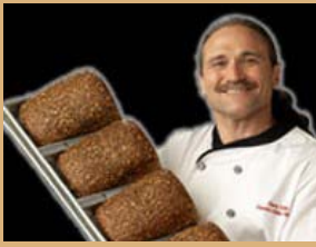
Salem-Keizer Sustainability Summit p. 4

MARION COUNTY PUBLIC WORKS - ENVIRONMENTAL SERVICES