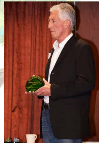
Recycler of the Year -Business Hillyer's Ford