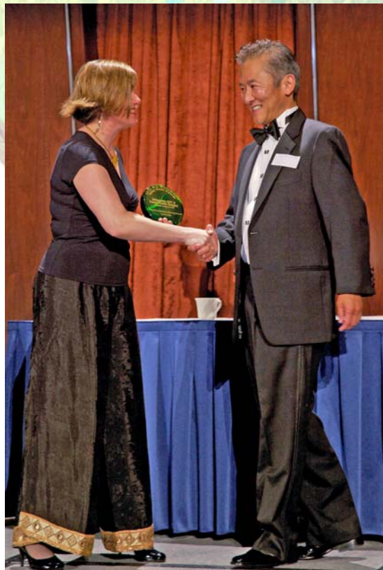
EarthWISE Business of the Year Willamette Ear, Nose, Throat & Facial Plastic Surgery