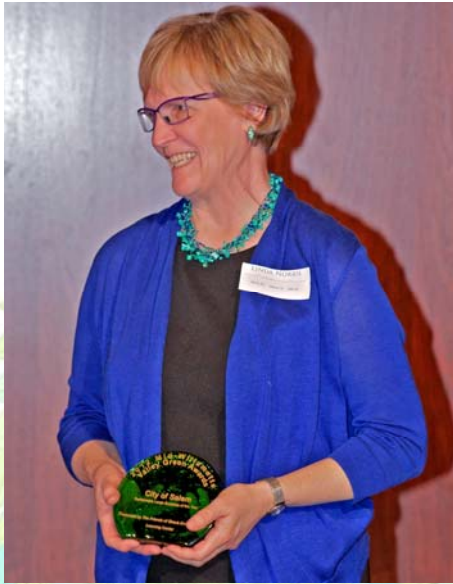
Sustainable Large Business of the Year City of Salem