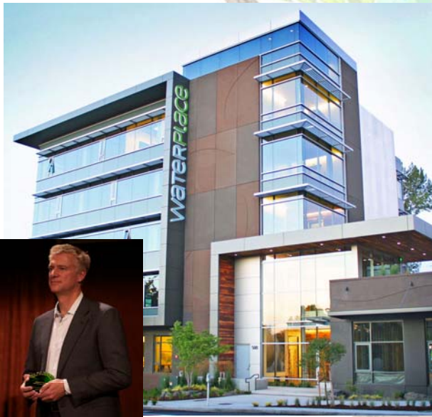
Green Building of the Year— New Construction WaterPlace