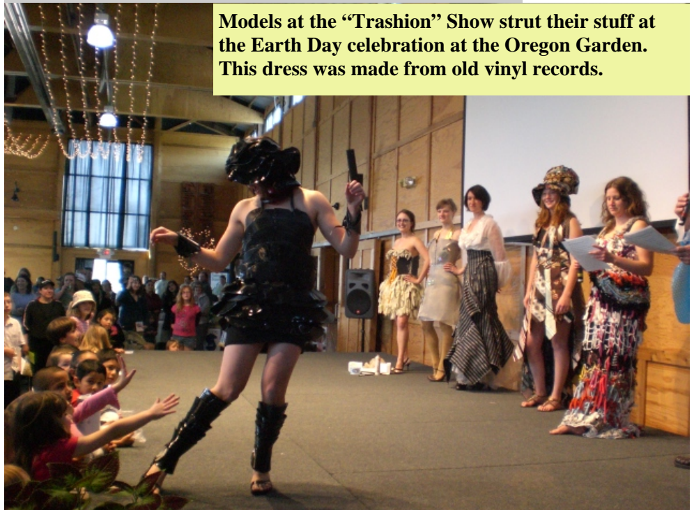
Models at the "Trashion" Show strut their stuff at the Earth Day celebration at the Oregon Garden. This dress was made from old vinyl records.