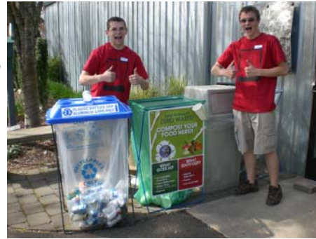
Silverton High School's Environmental Club played an integral role in the Earth Day recycling and composting this year!

paper products (i.e. napkins, plates), and recyclables (i.e. plastic cups and containers). This was the first time the Oregon Garden included the collection of compostables at their Earth Day event!