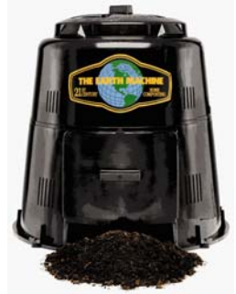
Buy an Earth Machine at the Truckload Composter Sale on May 3rd

ucts are leaves, wood-chips, and paper. Nitrogen items would include food, grass clippings and coffee grounds. Begin by alternating layers of carbon rich materials with layers of nitrogen rich materials. Dampen, turn and mix your pile every 4 to 7 days.