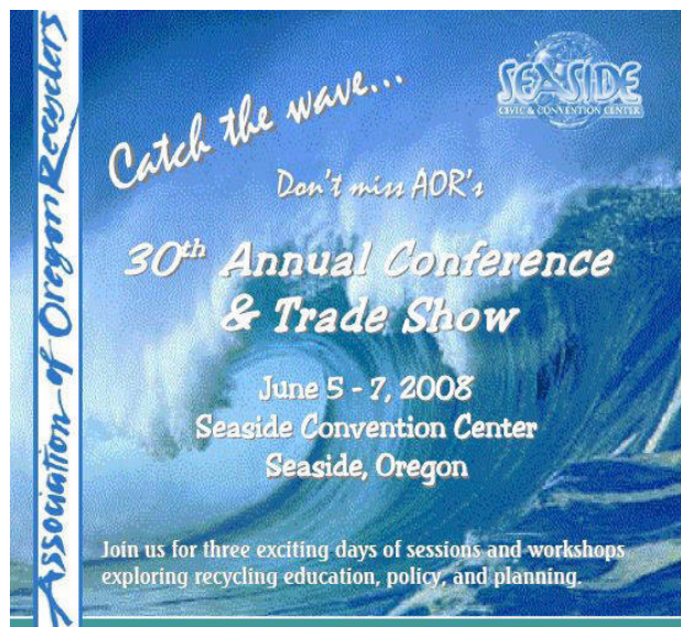
Catch the wave! Don't miss out on the 2008 AOR Conference!

through May 22, 2008. This registration fee includes sessions, meals, social events and the trade show. A reception on the beach with bonfires and s'mores, junk fashion creation and the SOLV beach cleanup are all included. Sustainability, climate-change, market trends, legislative opportunities, and many other topics critical to the industry will be presented at this event. For details about the sessions and speakers, or to join AOR, visit their website at: www.aorr.org .