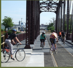
Sustainable Cities! Pg. 4

MARION COUNTY PUBLIC WORKS - ENVIRONMENTAL SERVICES