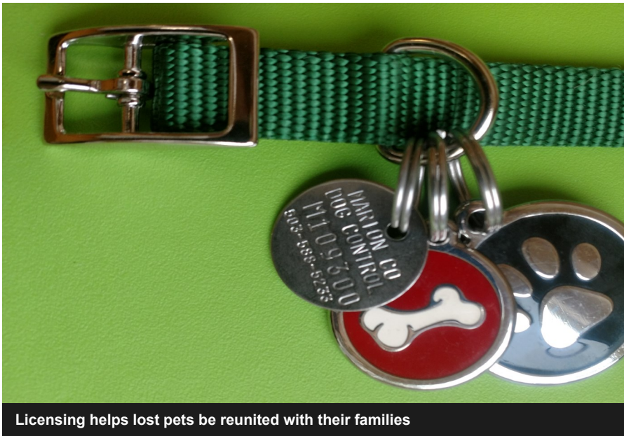
Licensing helps lost pets be reunited with their families