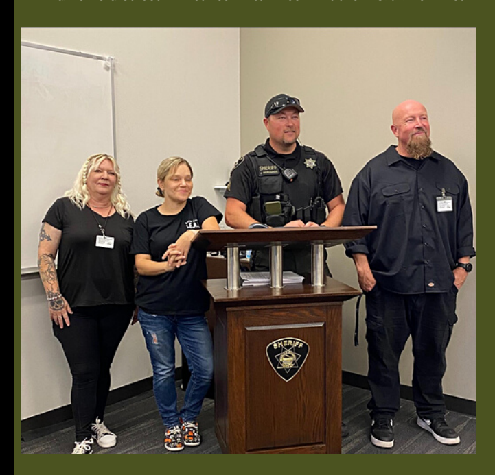
LEAD Team speaks at the Community Academy