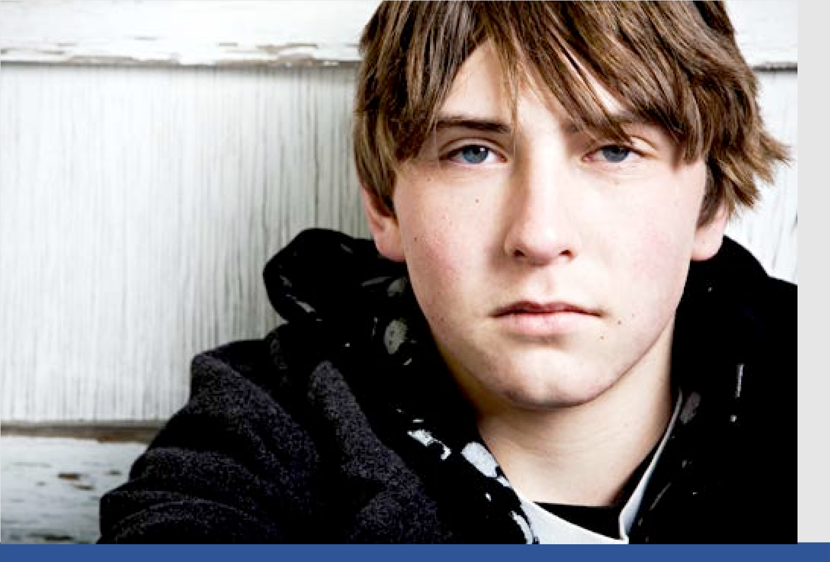
Youth Program Quality Standards