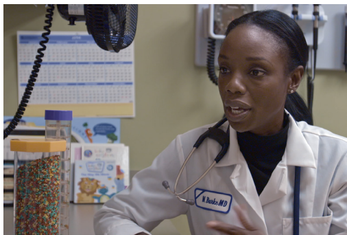
Nadine Burke Harris, MD Pediatrician CEO, Center for Youth Wellness San Francisco, CA