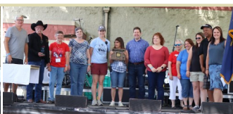
Fair Board & Key Volunteers