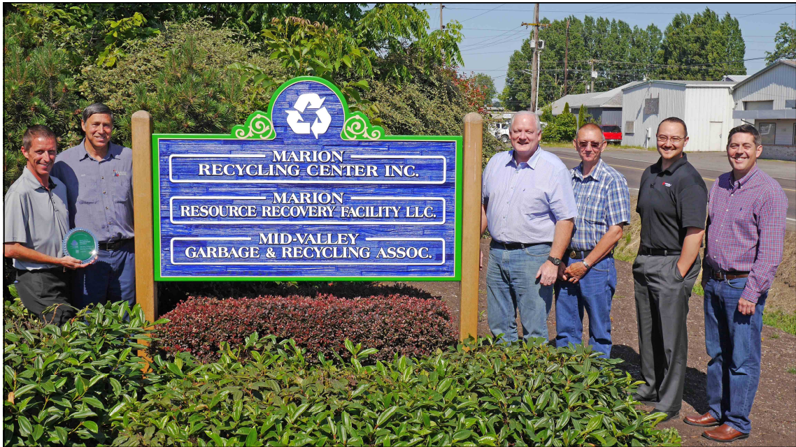
Marion Recycling Center 2008 - 2016