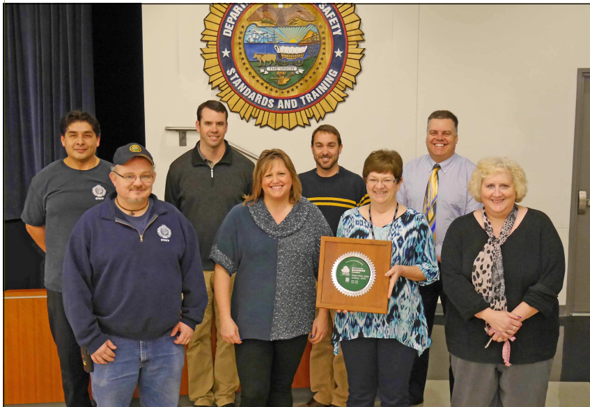
Oregon Dept. of Public Safety Standards & Training 2013 - 2016