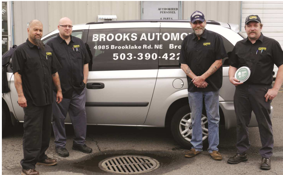
Brooks Automotive 2013 - 2016