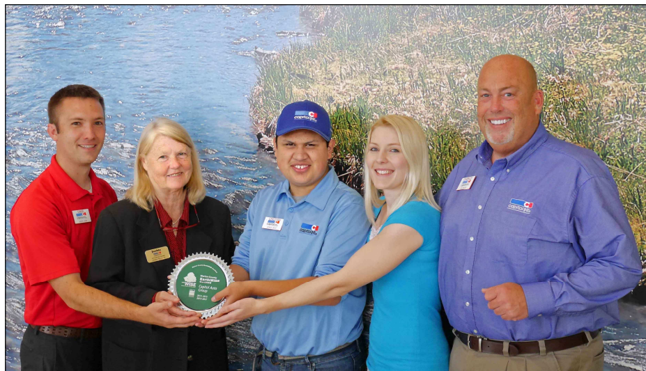
Capitol Auto Group 2013 - 2016