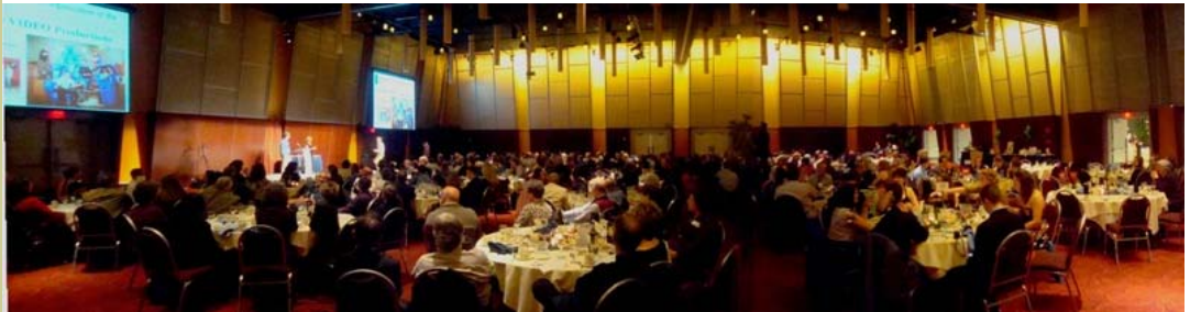
Attendees at the Green Awards held at the Salem Conference Center

March 3—The Friends of Straub Environmental Learning Center, Marion County Public Works Environmental Services and Garten Services, Inc. presented the winners of the third annual Mid-Valley Green Awards.