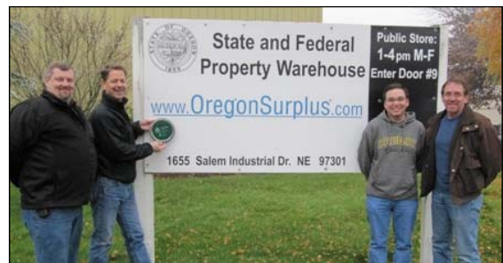
Green Team members at the Property Distribution Center show off their EarthWISE recertification.