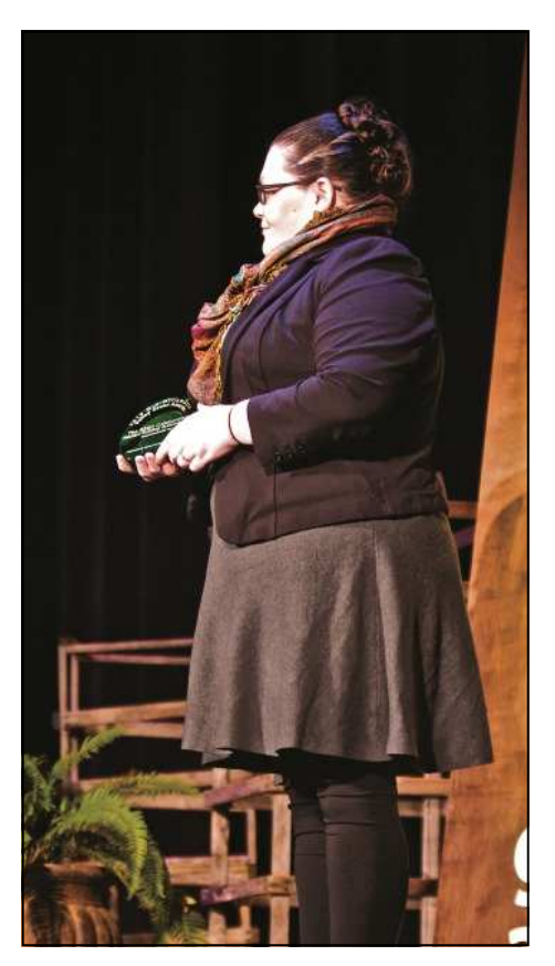
Green Product of the Year Award: The SEED Collaborative/ Modern Building Systems, Inc.