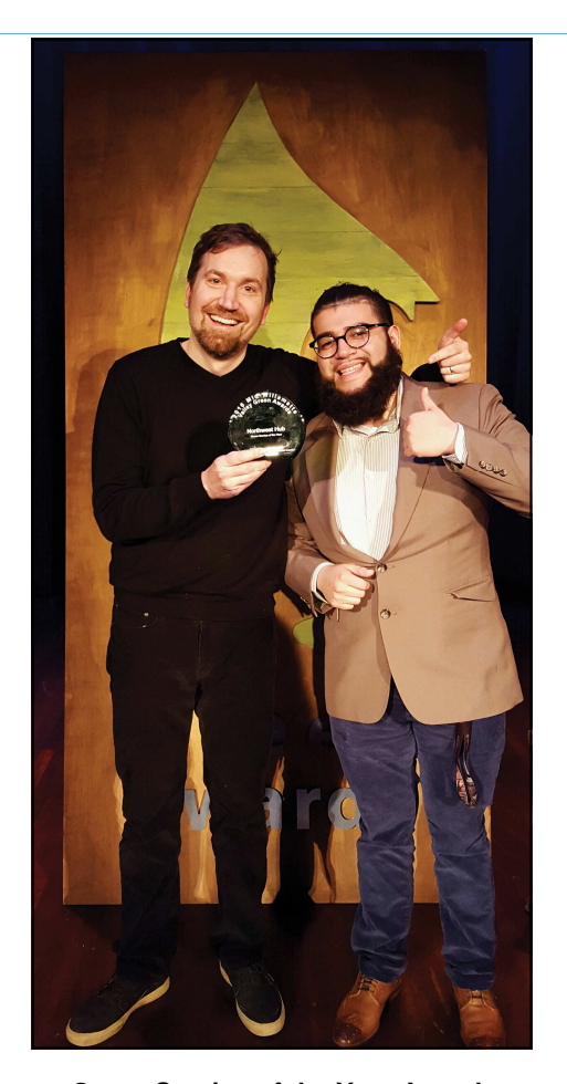
Green Service of the Year Award: The Northwest Hub