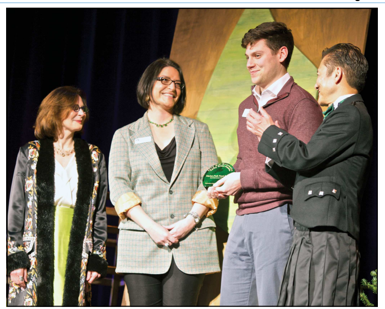
EarthWISE Business of the Year Award: Marion-Polk Food Share