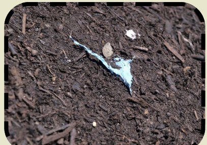
Beautiful compost with flakes of plastic bag. Commercial operators work hard to keep plastic out.

Either bag, compostable or biodegradable, is probably not going to be worth purchasing in most cases. Unless you're a food service provider, like a restaurant, and have PRIOR approval from your hauler about using a compostable bag (they'd never approve a biodegradable bag), I'd advise you to just save your money. They are most likely going to end up in the trash OR end up as a contaminant in some recycling system. Regular plastic bags, if clean, can at least be recycled at a grocery store or at the Salem-Keizer Transfer Station.