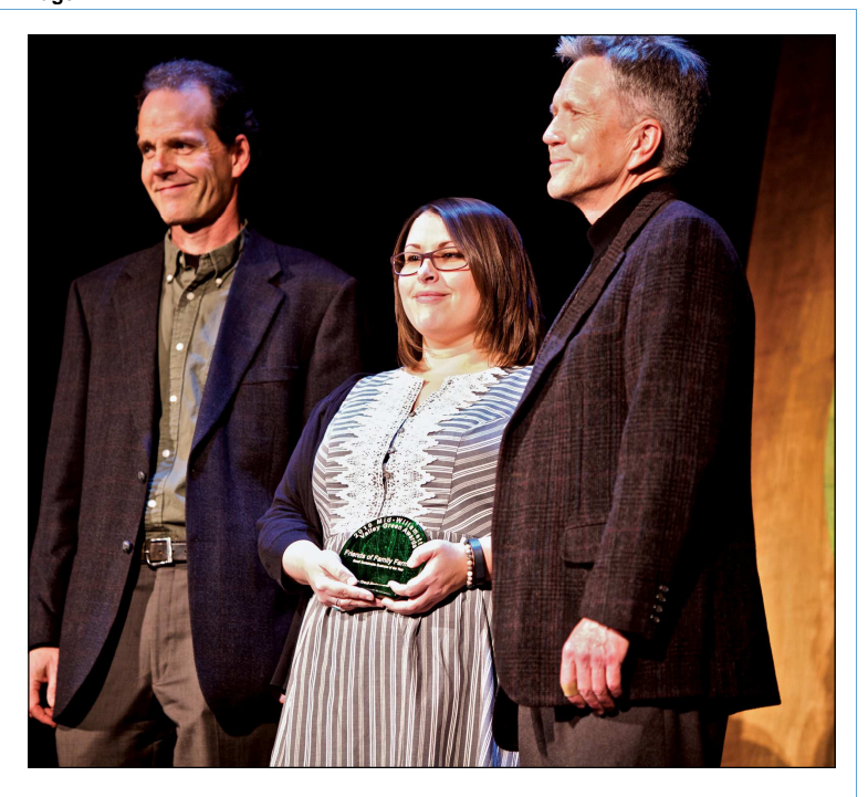
Small Sustainable Business of the Year Award: Friends of Family Farmers