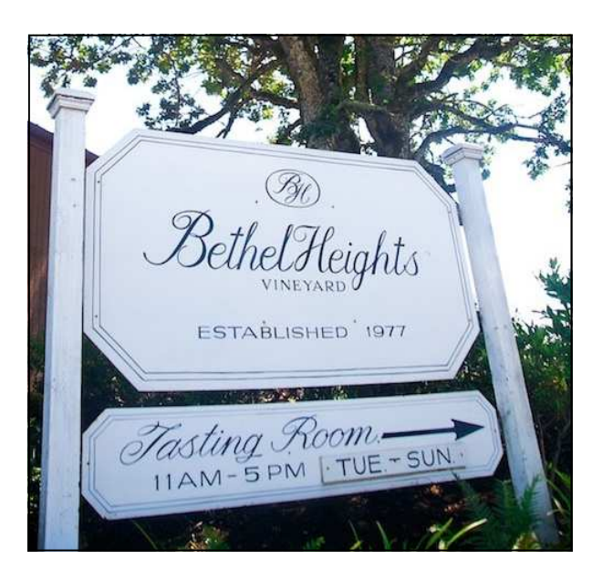
Sustainable Wine Producer of the Year Award: Bethel Heights Vineyard