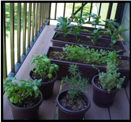
Green and happy.

My bell peppers are starting to come back; it was about 2 weeks ago that the aphids hit. They have new leaves, and what appear to be the tiniest buds you have ever seen. All in all, my garden is doing well, my carrots have sprouted, my herbs are happy, and my peppers will hopefully (someday) have fruit. I take pride in my garden, and I examine it daily, check in for new growth and any bugs that might be feasting. Living in an apartment did limit me on space, but it all came down to a little creativity, a desire for local produce, and longing to carry on the Neuenschwander family green thumb!