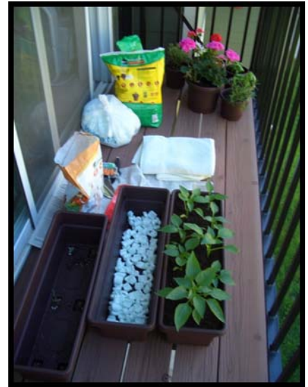
How to repurpose packing peanuts.

I ended up going to that garden center about 4 separate times. I was not prepared for what lay ahead with having my own terrace garden, and the things that I learned were significant. First things first, know how much space you have to put container plants into, and also plan a budget. Since I was completely new I