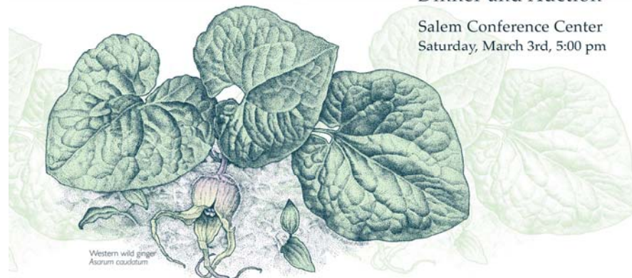
Western wild ginger Asarum canadense

Salem Conference Center Saturday, March 3rd, 5:00 pm