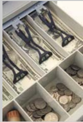
Great Grant Projects p. 4

MARION COUNTY PUBLIC WORKS - ENVIRONMENTAL SERVICES