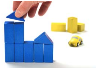
Introducing Recycling to Multi-Family Apartment Complexes

In Marion County, 23.5 percent of the housing units are in multi-family complexes and almost 79,000 people live in those complexes. Recycling at apartment complexes has some unique challenges, and the financial benefit of recycling (or just produc-