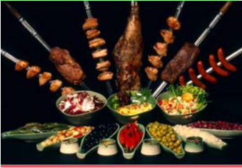
Green Party Tips p. 4

MARION COUNTY PUBLIC WORKS - ENVIRONMENTAL SERVICES