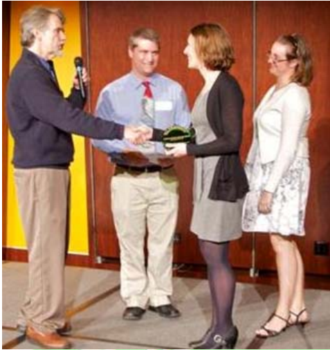
Recycler of the Year –Business/Organization Friends of Salem Saturday Market