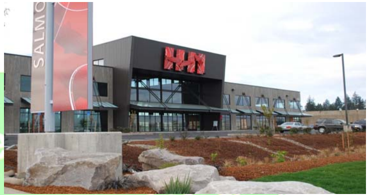
Green Building of the Year Salmon Run Industrial Park