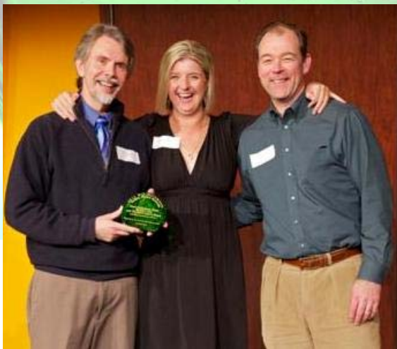
Sustainable Large Business of the Year The “Block”: Salem Conference Center, Bently’s Grill, & The Grand Hotel in Salem