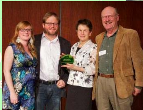
Sustainable Small Business of the Year Ilahee Vinyards