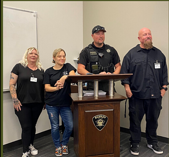
LEAD Team speaks at the Community Academy