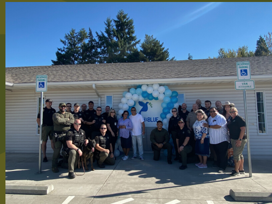
Faith and Blue Event, hosted by Tabernacle Church

From teaching at the Sheriff's Office Community Academy, speaking at the Santiam Service Integration Team Conference, or meeting with community members from across the county at the Faith and Blue event, our LEAD team was able to talk with folks from all walks of life to converse and come together in new and exciting ways and expand upon existing relationships.